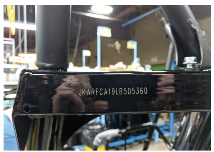
Kawasaki's laser engraving system etches vehicle identifications numbers (VIN) onto vehicle frames with a 3D printed clamp (left).