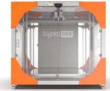
New ONE with upgrade enclosure package

The ONE comes with a new, lighter, and more precise portal and can now be configured easily to the needs of the user. Customers are able to choose from single, dual, or twin extruder modes plus add-ons like an enclosed housing and even the printer's color to create the perfect machine just for them. Then as their 3D printing needs evolve, they can simply upgrade their ONE with additional features.